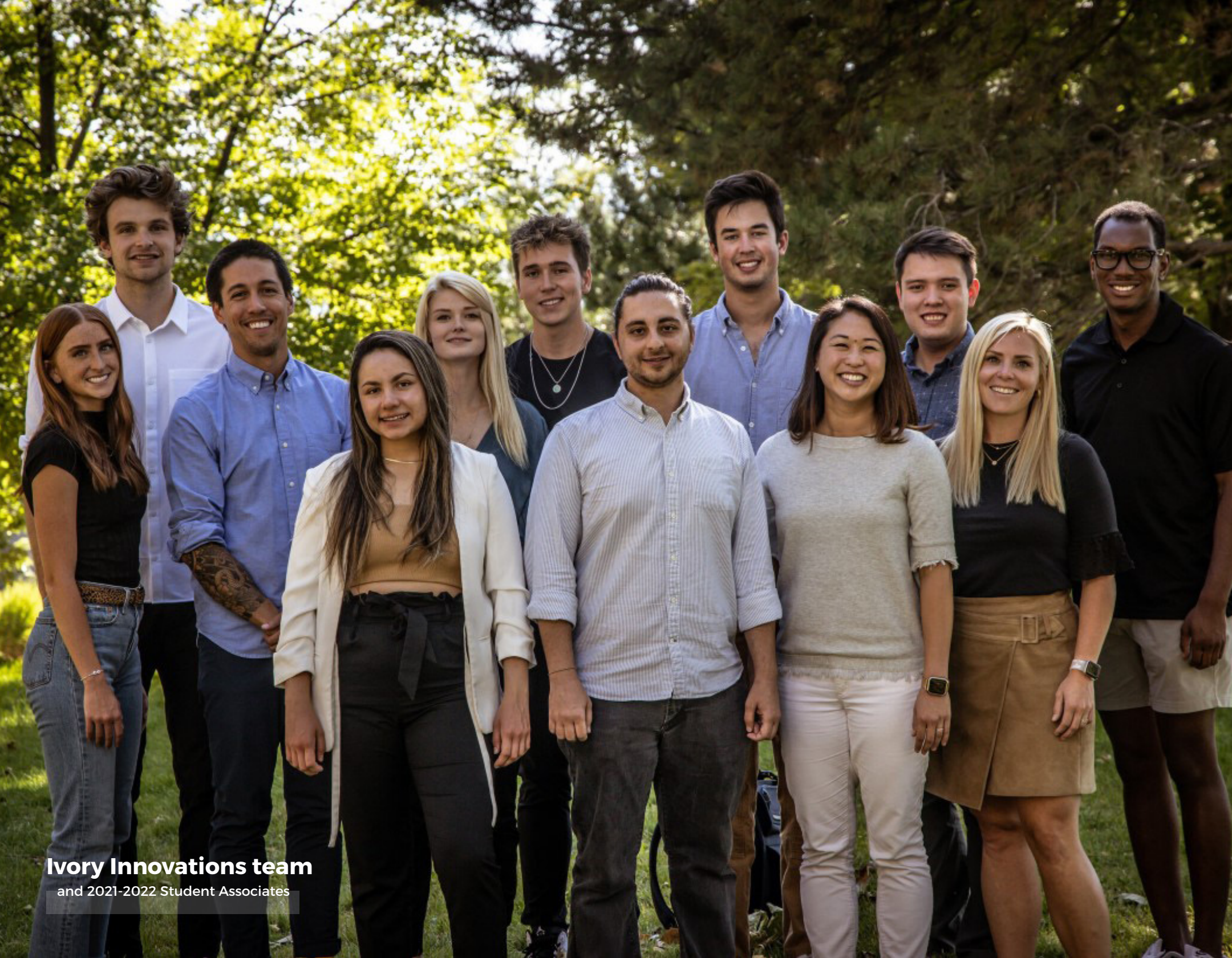
Ivory Innovations team and 2021-2022 Student Associates